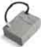
PS124 24 V battery with integrated battery charger. Pc/pack 1