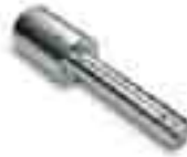
CRA9 Adapter for diameter 31.75 (1.1/4\"/>