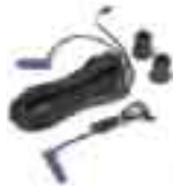
TMF Pair of photocells for optical type sensitive edge. Pc/pack 1