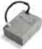
PS124 24 V battery with integrated battery charger. Pc/pack 1