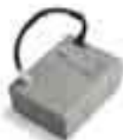
PS124 24 V battery with integrated battery charger. Pc/pack 1