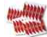
WA10 Red adhesive reflector strips. Pc/pack 24